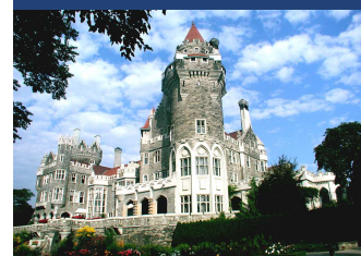
Magnificent Casa Loma Castle in Toronto