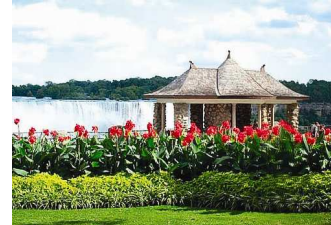
Visit beautiful Queen Victoria Park